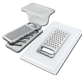
KIT RÂPES ET PLANCHE DE DECOUPE HDPE